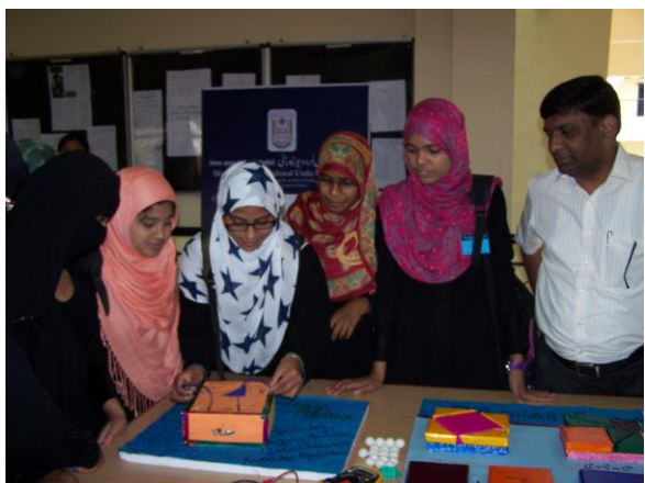
Science day celebrations

The School of Sciences was established in the year 2006. The school currently has five departments viz., Department of Mathematics, Physics, Chemistry, Zoology and Botany. The School also comprise of Polytechnics and Industrial Training Institutes (ITI) located at Hyderabad, Bengaluru and Darbhanga. The School also offers Paramedical programs. The profiles of the departments are as follows: