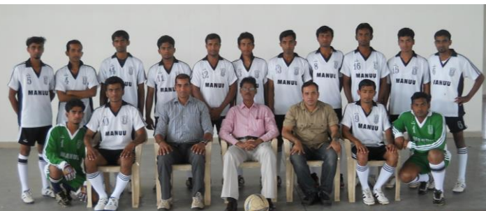
University Foot Ball Team