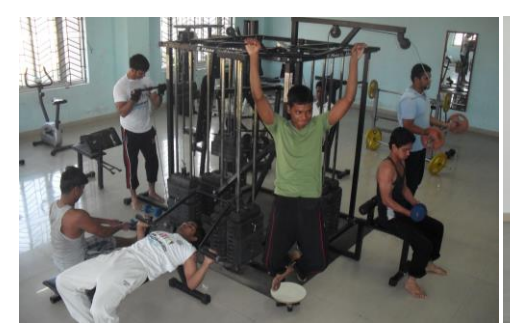
A glance at Gymnasium

The University has good infrastructure for Games and Sports. The facility has well equipped indoor stadium accommodating fitness center and indoor games like shuttle, badminton, table tennis etc. The University promotes sports and games culture among the student community by organizing coaching camps for various sports and games for the University teams. Track and field for athletic events; cricket ground and volley ball facilities are also available.