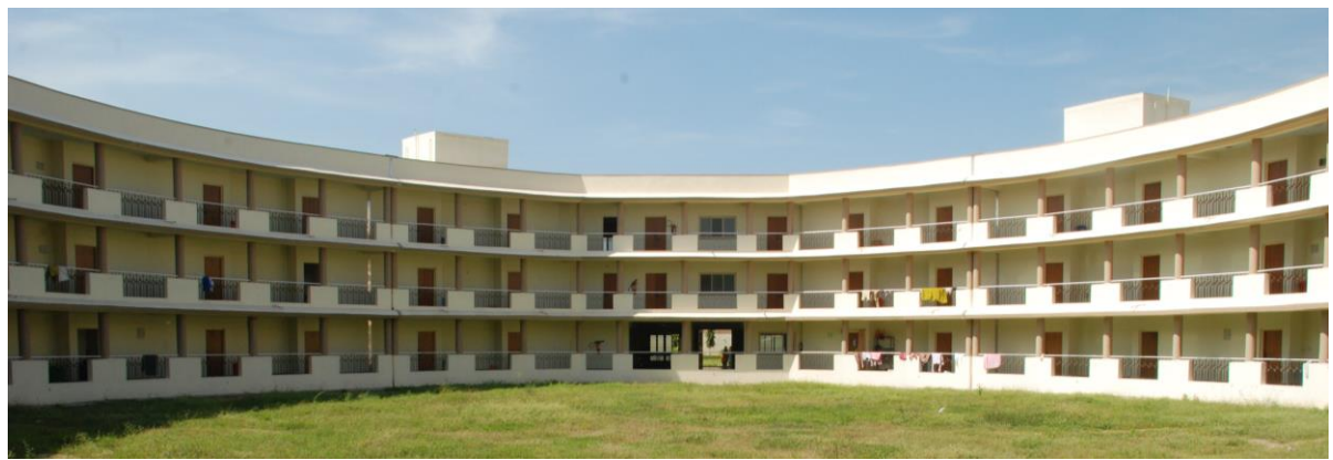
Girls Hostel (Old)

The Urdu University provides hostel facility in the University Campus for both male and female students for campus based programs. There are 3 hostels on the campus, of which 2 are for men and 1 is for women. However, the hostel facility is regulated by "Rules and Regulations" (please refer University website). As hostel accommodation available is limited, mere admission in any of the University Programs does not entail a right to admission to the University Hostels. It shall be the prerogative of the University authorities to frame the rules and regulations periodically for hostel admissions by assessing the availability of seats in each hostel. The hostel will be allotted to the students based on the Admission Procedure given below, when they apply for accommodation with sufficient documentary proof.