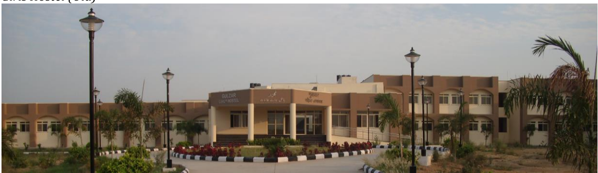
Gulzar Girls Hostel (New)