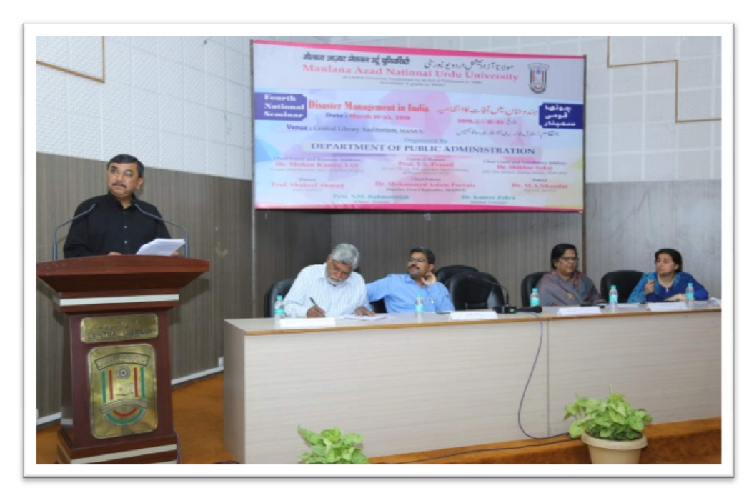
Fourth National Seminar on "Disaster Management in India" 21-23 March,2018