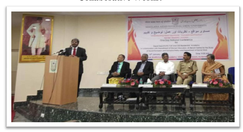
Image 3 ACSSEIP In Association with Equal Opportunity Cell, CSE, Deptt of Women Education and Social Work organized one Day National Seminar on "Understanding Equal Opportunity: Concepts and Practice" at MANUU, Hyderabad on 16 January 2018.