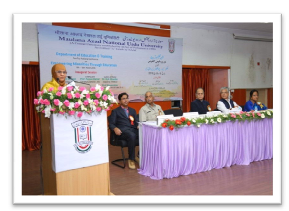
Two Day National Conference held on 8<sup>th</sup>& 9<sup>th</sup> March, 2018