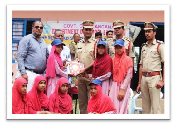
Inter School Zonal Level Tournament