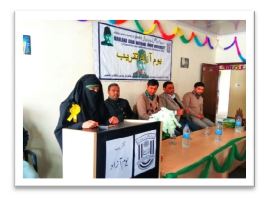
Independence Day Celebrations – 15<sup>th</sup>August, 2017