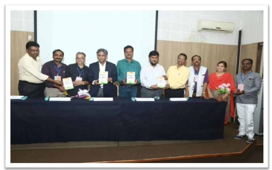
Utsah Wall Magazine opening