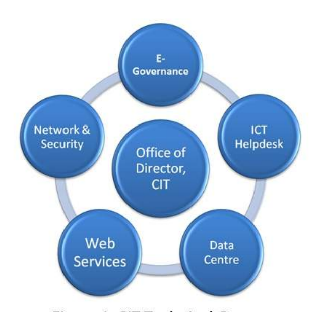
Figure 1: CIT Technical Groups

To achieve the above Vision and Mission, MANUU has initiated refurbishing of its Centre for Information Technology to create a team of ICT Professionals organized in five Technical Groups as shown in the diagram given below: