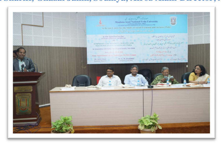
Figure 1 Inaugural Session of International Seminar on Ethnicity and Minority: debates and discourse in contemporary India.