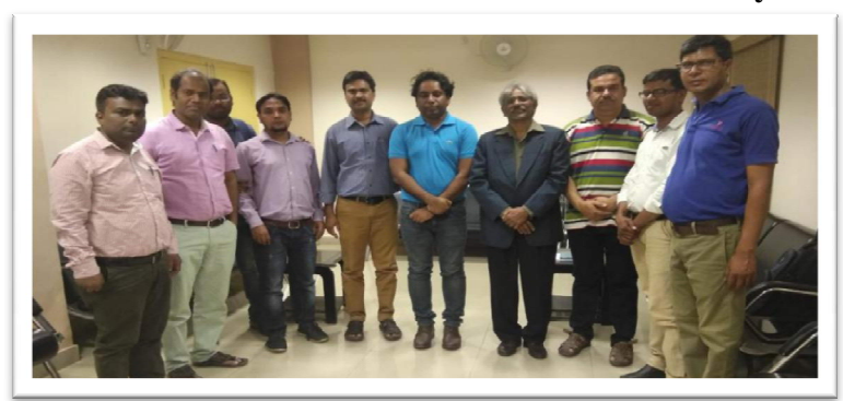
Image 2 Group Photo after the Session at University Guest House, MANUU, Hyderabad 14 March, 2018

Interactive Session with Lock Haven University