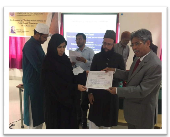
Five day Workshop on Journalistic Translation, 19 – 23 March, 2018 Details of Working Alumni of the Department: M.A.(Arabic) Programme:

Sr.; Name; Year of Passing; Place of Work; Design.; Institution/Company; Contact Details