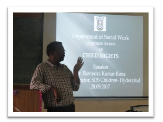
Invited Guest Lectures