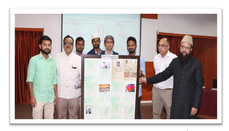
Release of Wall Magazine on Science Day Celebration, 28th February, 2018.