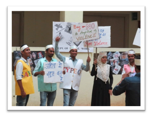
International Nonviolence Day