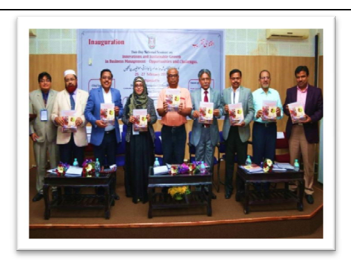
National Seminar on "Innovations and Sustainable Growth in Business Management- Opportunities and Challenges" organised by the Department during 26-27 February, 2018.