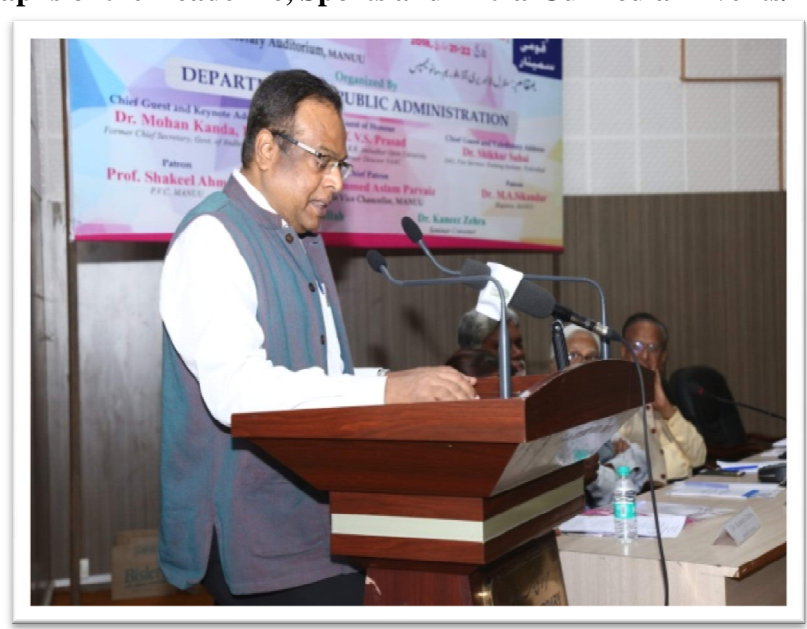
Fourth National Seminar on "Disaster Management in India" 21-23 March, 2018